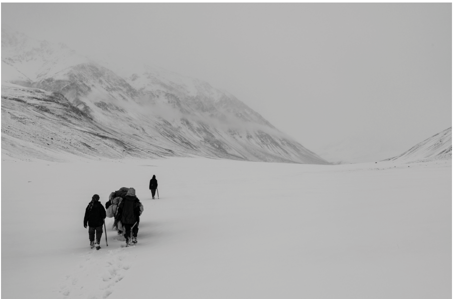
Winter in the Little Pamir

A Pamir is a wide and open valley ideal for grazing. Seen from above with topographic perspective, the Pamirian Knot denotes the Massif at the northwestern end of the Himalaya.